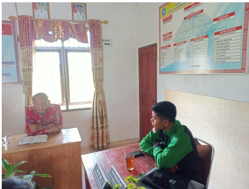
Gambar 3. Wawancara bersama Kepala Desa Siponjot Jaya