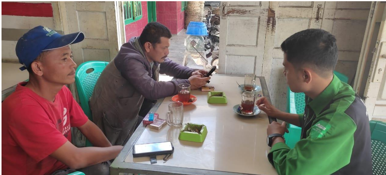
Gambar 1. Wawancara bersama Direktur BUMDes Siponjot Jaya dan Bendahara BUMDes.